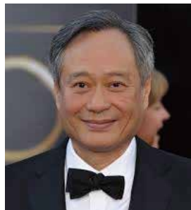
Ang Lee 李安 78 th & 85 th Oscar-winning director