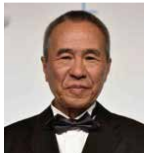
Hsiao-Hsien Hou 侯孝賢 Internationally acclaimed director