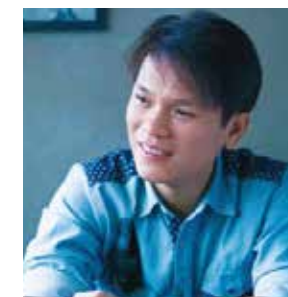
Sheng-Min Chiang Graphic Communication Arts Best New Actor, 2008 Golden Horse Award, Taiwan