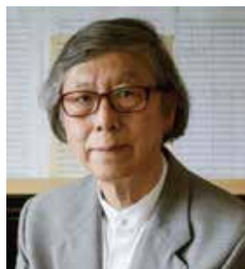
Shui-Long Ma 馬水龍 Composer