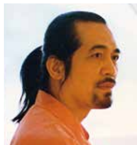
Tai-Hsiang Lee 李泰祥 Composer